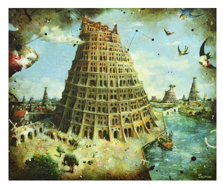
Fig. 5. S. Rimashevsky. Eternal aspiration. Oil on canvas, 2001 https://nevsepic.com.ua/art-i-risovanaya-grafika/3817-hudozhnik-sergey-rimashevskiy-58-rabot.html

The artist creates a new architectonics of familiar forms of architecture, combining elements of medieval European Gothic and traditional Arabic architecture into a single urban space-spolia. The realism and elaboration of details emphasizes the uniqueness of the whole. The city-spolia embodies the possibility of the existence of a global culture. This is a vision that has a real basis – the holy city of Medina for Muslims in Saudi Arabia.