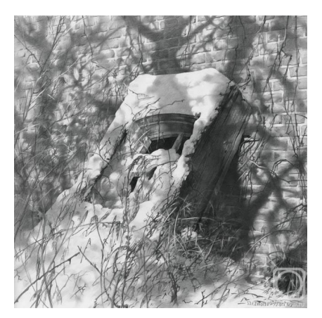
Fig. 7. D. Chernov A window near the wall. Paper, pencil 47 x 47cm, 2011 https://artnow.ru/kartina-Okno-vozle-steny-hudozhnik-Chernov-Denis-482050.html

Two space-time – the everyday and the sacred – are in one place (Fig. 8). The artist connects them with each other through a thing: wooden benches standing in the middle of a field and separated by a dirt road that goes far beyond the horizon, from where the sun should rise. Above them, high in the sky, occupying almost the entire surface of the canvas, the ghostly outlines of the central nave of the Gothic cathedral appear, seemingly a vision. The reality of an ordinary place changes, acquiring the qualities of a different being, becoming tangible. A thing (bench), extracted from a familiar context, and placed in a place alien to it, gives it a double semantic meaning and shifts ideas about the signified and the signifier.