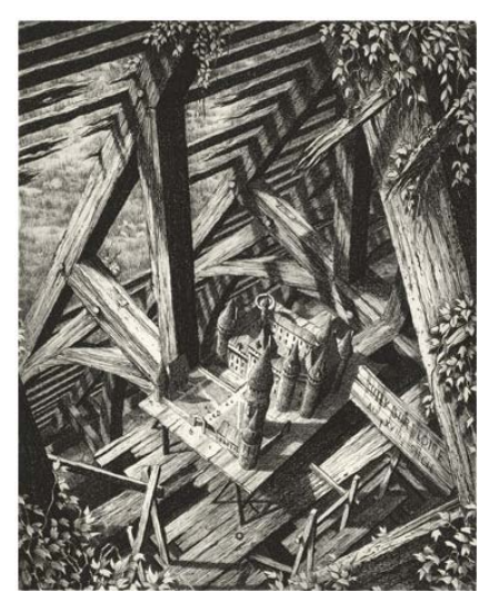
Fig. 2. G. Trignac. Sully on the Loire, castle. Etching, chisel, dry needle 17.5 x 21.5 cm, 1995 http://www.trignac-gerard.com/spip.php?page= document&id document=77&id article=4

2. The ruins of the present are abandoned buildings falling into decay, destroyed architectural objects that have arisen as a result of military operations, natural and environmental disasters, etc.