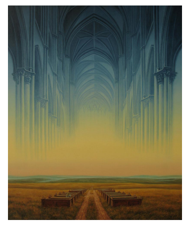
Fig. 8. M. Kolpanowich Cathedra. Oil on canvas, 100 x 80 cm, 2010 https://issuu.com/asiura/docs/marcinkolpanowicz