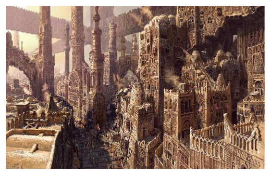
Fig. 6. L. Gapaillard. A look at the Medina, 2011 http://laurentgapaillard.blogspot.com/