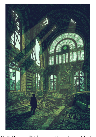
Fig. 3. D. Danger "Take your time, try not to forget, we will never" Color printing 24 x 36", 2015 https://danieldanger.storenvy.com/products/ 14775624-take-your-time-try-not-to-forget-green

The history of human civilization has always been accompanied by wars and destruction. Art of all eras found "beauty in darkness and cruel forces, physical and spiritual, one of the symbols of which is" ruin [4, PR, XX]. The urban world, dying without hope, from which all the colors of life have gone, swaying at its very core – the silent world of the "lost future", from which the traces of human presence disappear, causing a feeling of horror (Fig. 4). The realistic depiction of the skeletons of similar "inanimate" and "motionless" buildings, which are eroded by erosion, going into a hazy perspective, nevertheless leaves doubt about their reality. In the artist's interpretation, the apocalyptic dystopia of the modern world is a nightmare from which it is impossible to wake up.